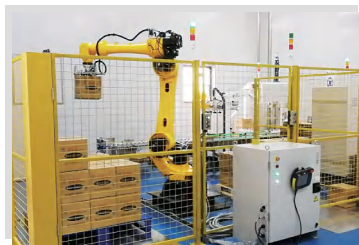
食品厂纸箱码垛 Carton palletizing in food factory