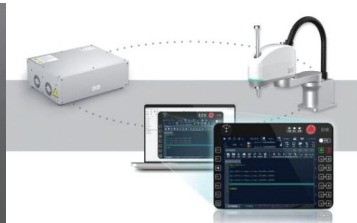
智能设备管理系统 Intelligent Equipment- management System