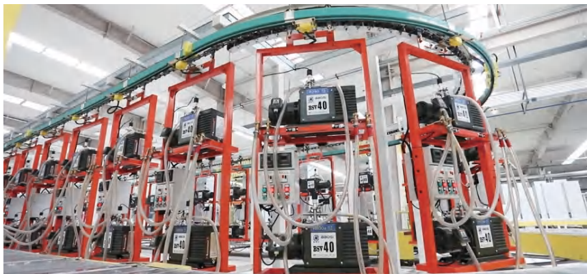
地面输送装配系统 Ground transportation and assembly system

信息化工业软件系统 地面输送装配系统 空中输送系统 机器人集成应用 自动化冲压连线