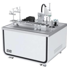
SCARA 工业机器人 SCARA Industrial Robot