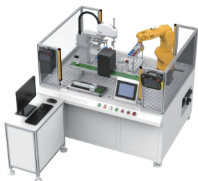
实训平台 / Training platform

Intelligent Master Actuator Technology: based on the existing actuator technology, to develop the intelligent master actuator products with the functions of task-level planning, intelligent identification, dynamic obstacle avoidance and flexible operation, and establish the important cornerstone of general robot technology