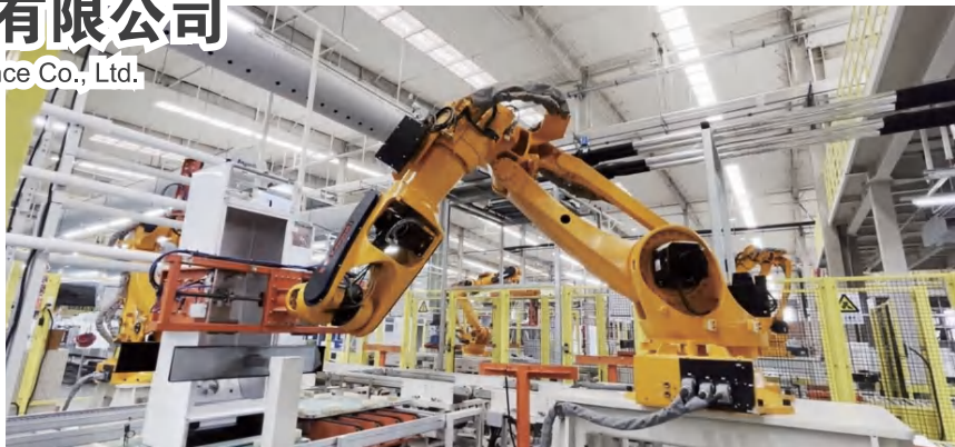
机器人集成应用 Robot integrated application

青岛北洋天青数联智能有限公司（以下简称北洋天青）成立于 2013 年，立足于家电行业，面向制造业，是一家专注智能制造、以技术创新为核心引领行业发展的智能工厂整体解决方案供应商，为自我革新的制造企业提供基于云端、算法驱动、灵活可配置的多平台实时协同系统，搭配机器人应用、自动化设备、智能物流等硬件设施，用轻量高效的方式帮助制造业客户提高生产效率、降低制造成本、打通信息孤岛，真正实现数据驱动制造。针对不同行业的需求，整合运动控制、影像处理、机械人应用等技术，配合软件系统开发为客户提供最具竞争力的产品和服务。业务涵盖消费类电子、家电业、医疗品、新能源电池、食品领域。