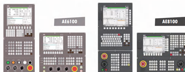
数控系统 / Numerical control systems