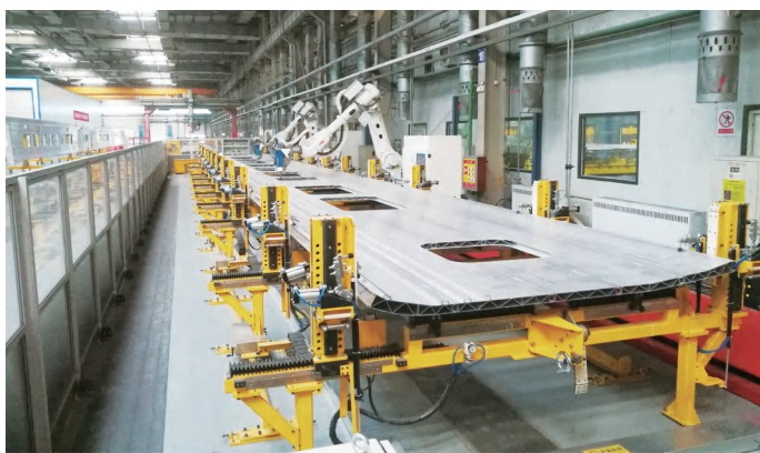
交通生产线 / Transit production line