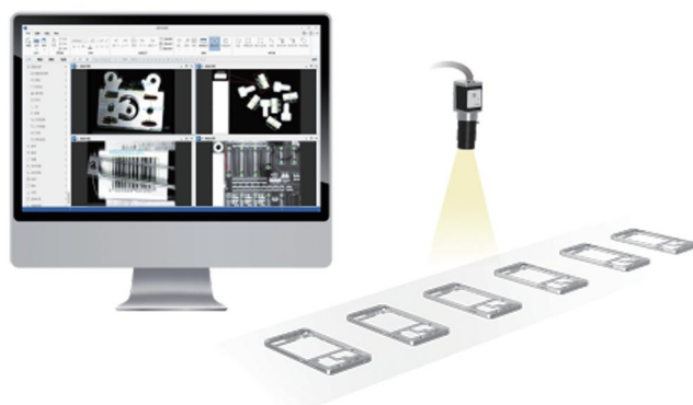
视觉系统 / Vision system

Machine Vision: applied for graphical programming, with many functions such as defect monitoring, object recognition and target classification and so on