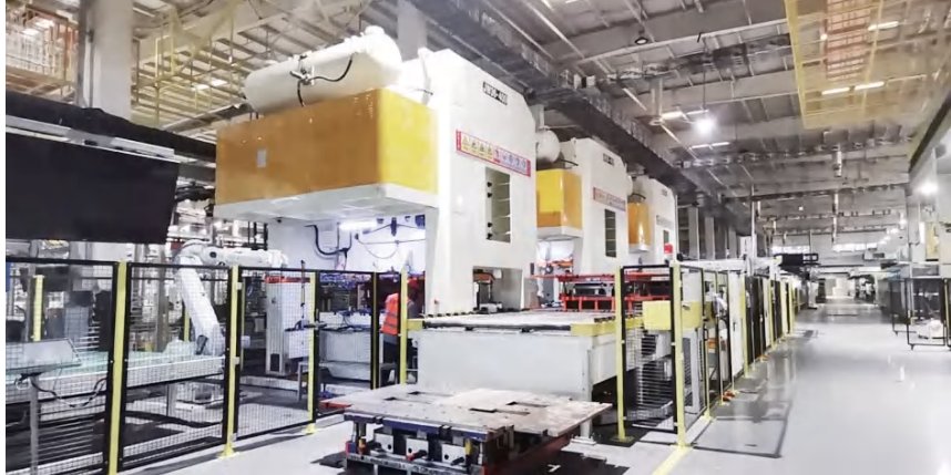
冲压连线 - 多维连线、自动冲压 Stamping bounding-Multidimensional bounding, Automatic Stamping