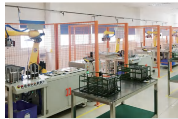
手机壳打磨抛光 Grinding and polishing of mobile phone case