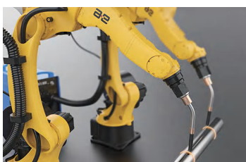
自动化焊接工业机器人 Automatic-welding Industrial Robot