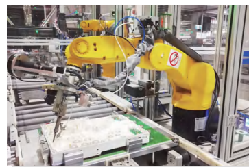
电子元件锡焊 Tin soldering of the electronic components