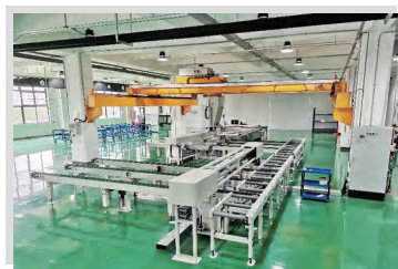
检测线 Detection line