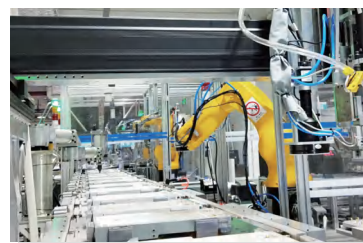
滤波器谐振杆装配 Filter resonant rod assembly