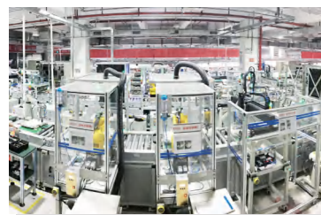
无源滤波器自动化智能柔性装配生产线 Automatic intelligent flexible assembly line of passive filter