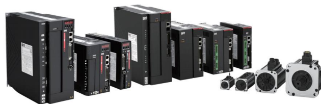
伺服系统 / Servo systems