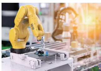
六轴工业机器人 Six-axis Industrial Robot

Software Products: Software Package of Process Application (arc-welding function package, bending and palletizing), 3D Off-line Programming and Simulation Software (RobotLive), intelligent Equipment Management System (E-Manager), PC Programming Software (RPsim), MES